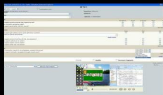
INTEGRATED GRADING FORMS