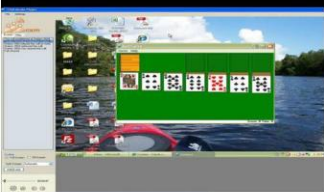
CXM SCREEN CAPTURE

Click Here to View the Latest CXM Whitepaper